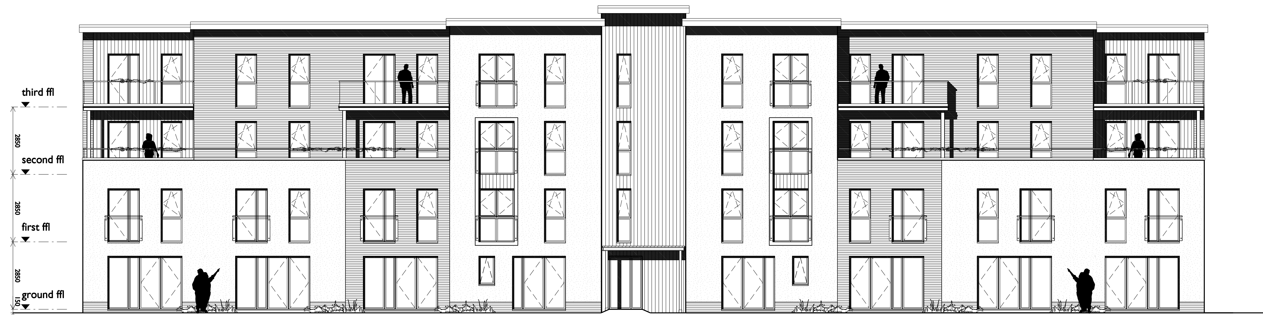
BLOCK Hiii WEST ELEVATION