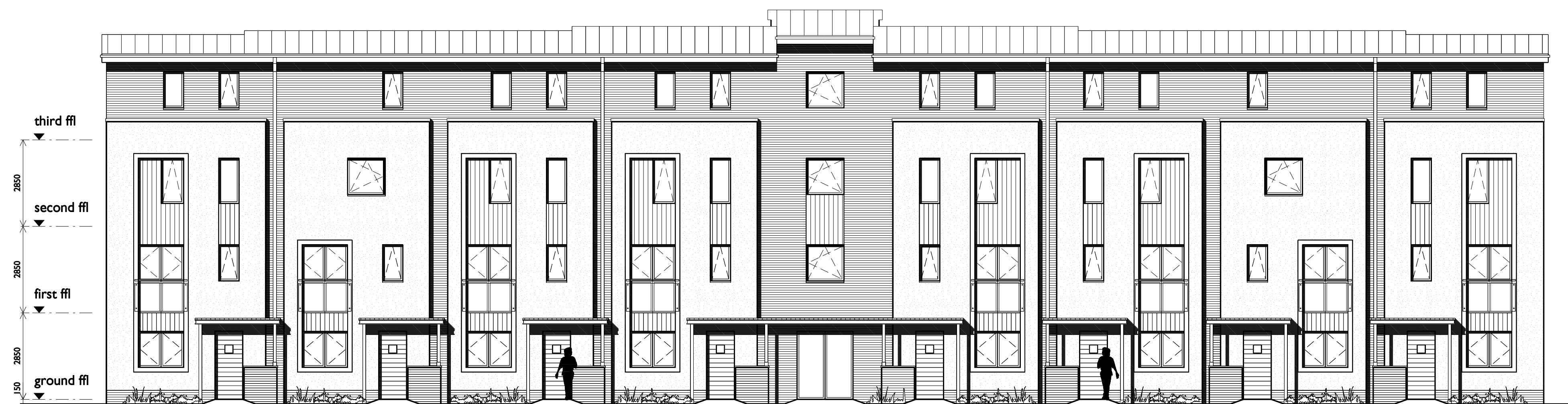
BLOCK Hiii EAST ELEVATION