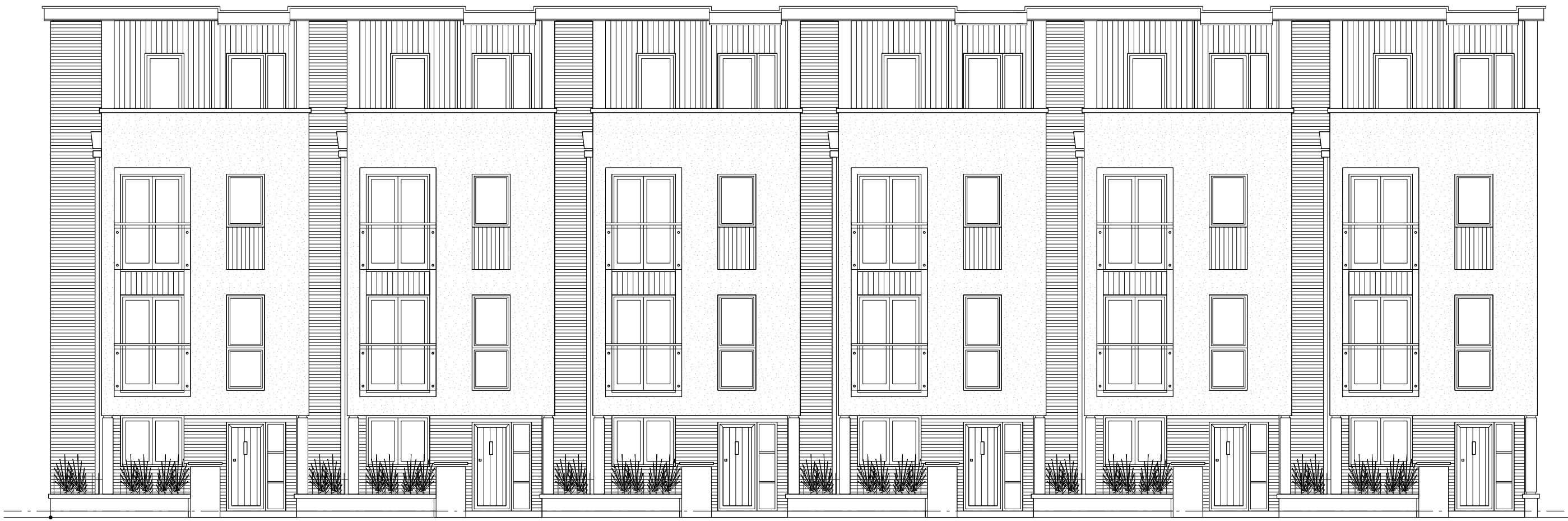
BLOCK Ji NORTH ELEVATION

THIS DRAWING IS FOR PLANNING PURPOSES ONLY. IT IS NOT INTENDED TO BE USED FOR CONSTRUCTION PURPOSES. WHILST ALL REASONABLE EFFORTS ARE USED TO ENSURE DRAWINGS ARE ACCURATE, JOHN THOMPSON & PARTNERS ACCEPT NO RESPONSIBILITY OR LIABILITY FOR ANY RELIANCE PLACED ON, OR USE MADE OF, THIS PLAN BY ANYONE FOR PURPOSES OTHER THAN THOSE STATED ABOVE.