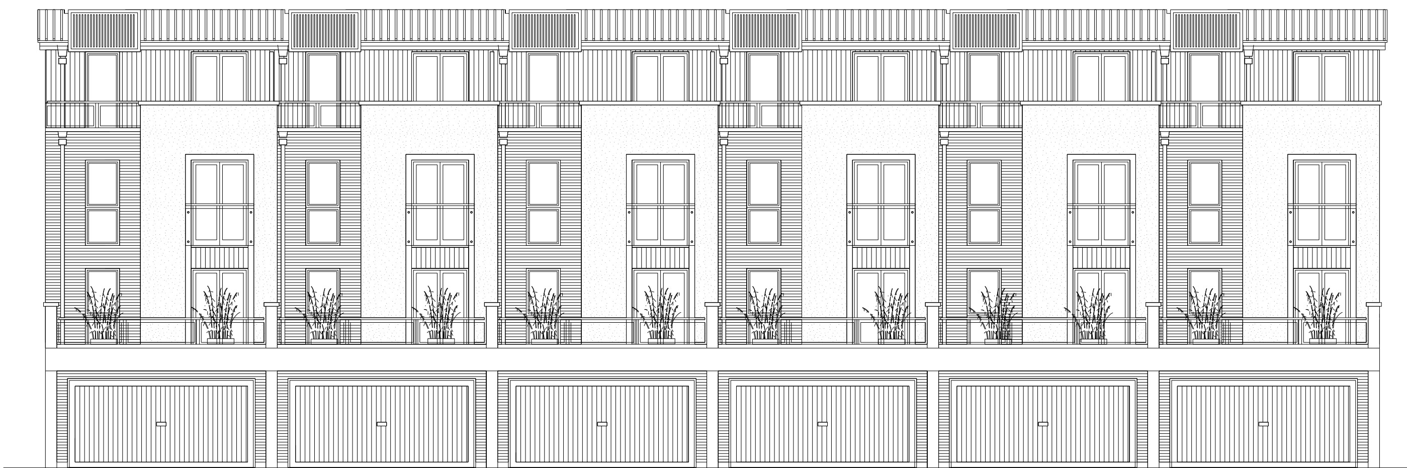
BLOCK Ji SOUTH ELEVATION