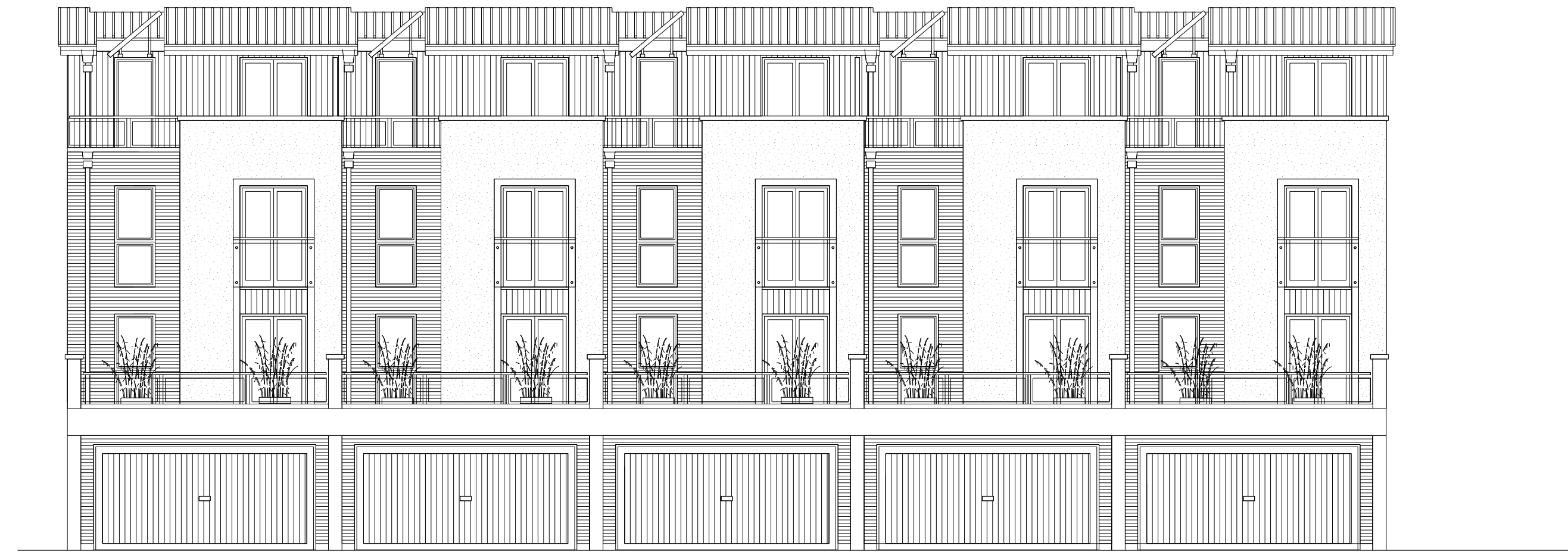
BLOCK Jii EAST ELEVATION