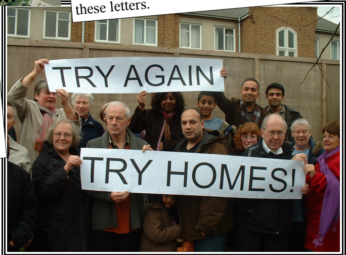
Campion Concerns offers advice to the developer April 2007

Readers of this Newsletter know that Campion Concerns has never opposed social housing. We have argued that it should be of a high standard. We opposed long corridors joining social housing flats and these were eventually removed. This did not stop Try Homes telling the Inquiry that we opposed social housing. All's fair in love and development?